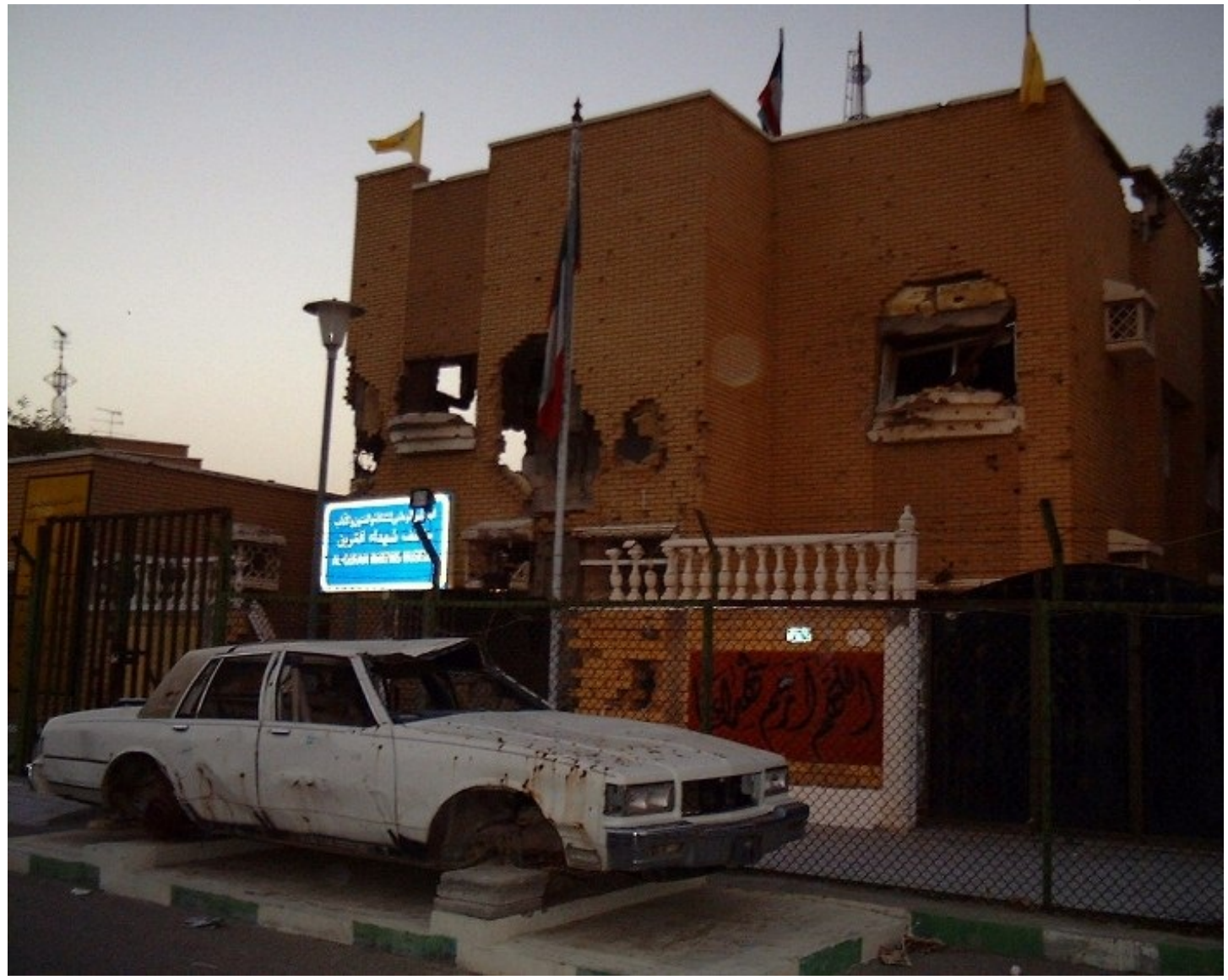
Monument of Iraqi Invasion

I heard a story of Iraqi invasion to Kuwait in August 1990 from a car driver. He is a Sri Lankan. He was a car driver of Austrian ambassador at that time.