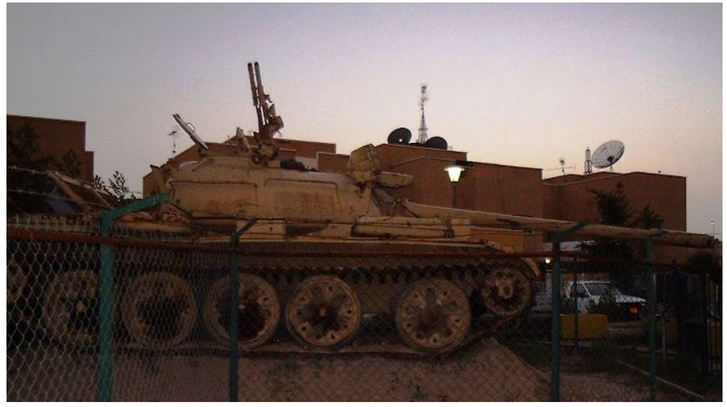
Monument of Iraqi Invasion

I heard a story of Iraqi invasion to Kuwait in August 1990 from a car driver. He is a Sri Lankan. He was a car driver of Austrian ambassador at that time.