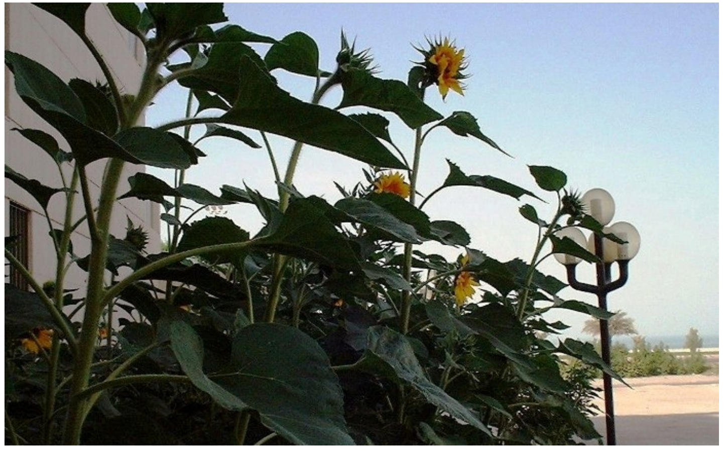
Salmiya, Kuwait / November 1999

I could see sunflower in winter in Kuwait. Temperature went down below 10 degree Celsius in the morning and night, but temperature went up to around 24 degree Celsius in day time. It was like an early summer in Japan.