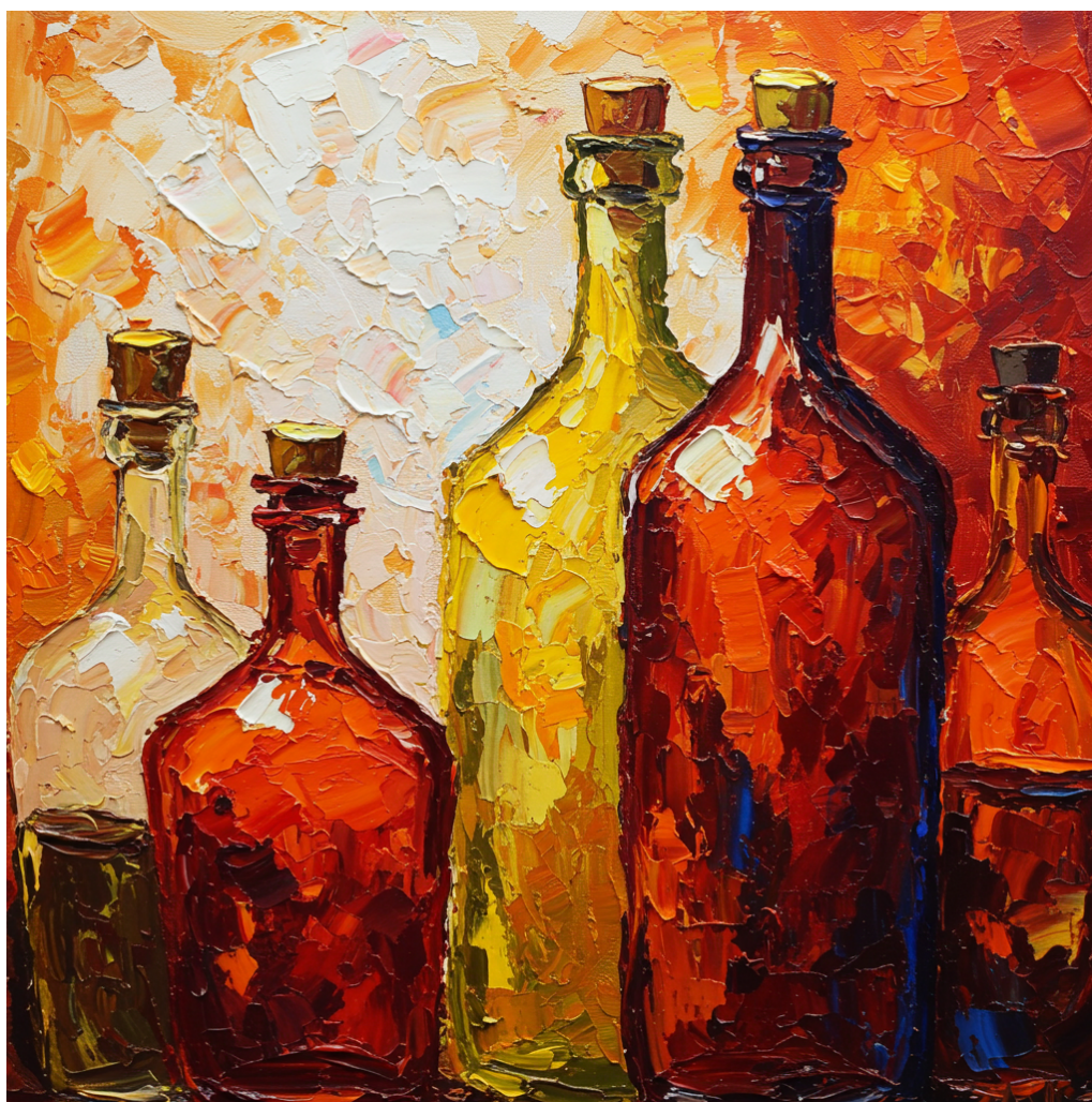
asHbottle ( 1 ) .jpg