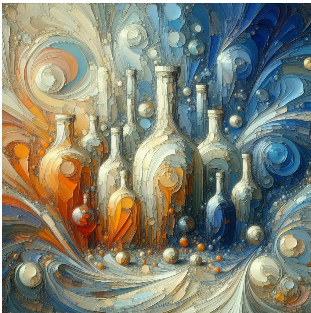
asHbottle ( 6 ) .jpg