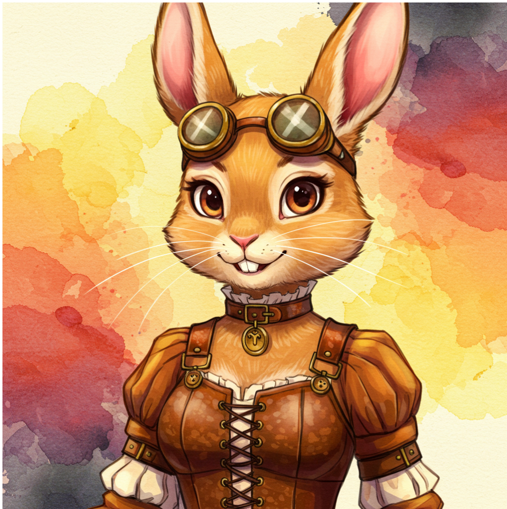
asAPrabi ( 1 ) .jpg