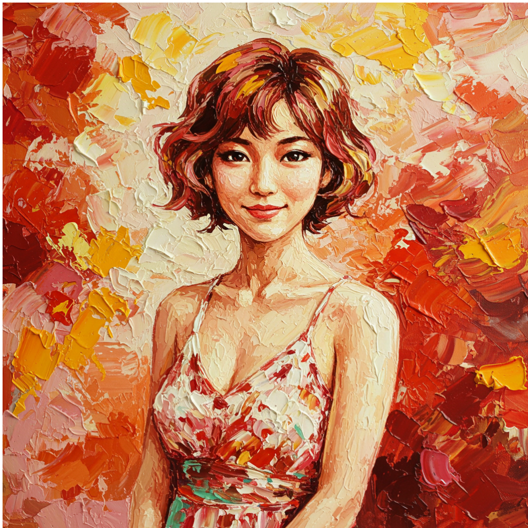
asGgirl ( 6 ) .jpg