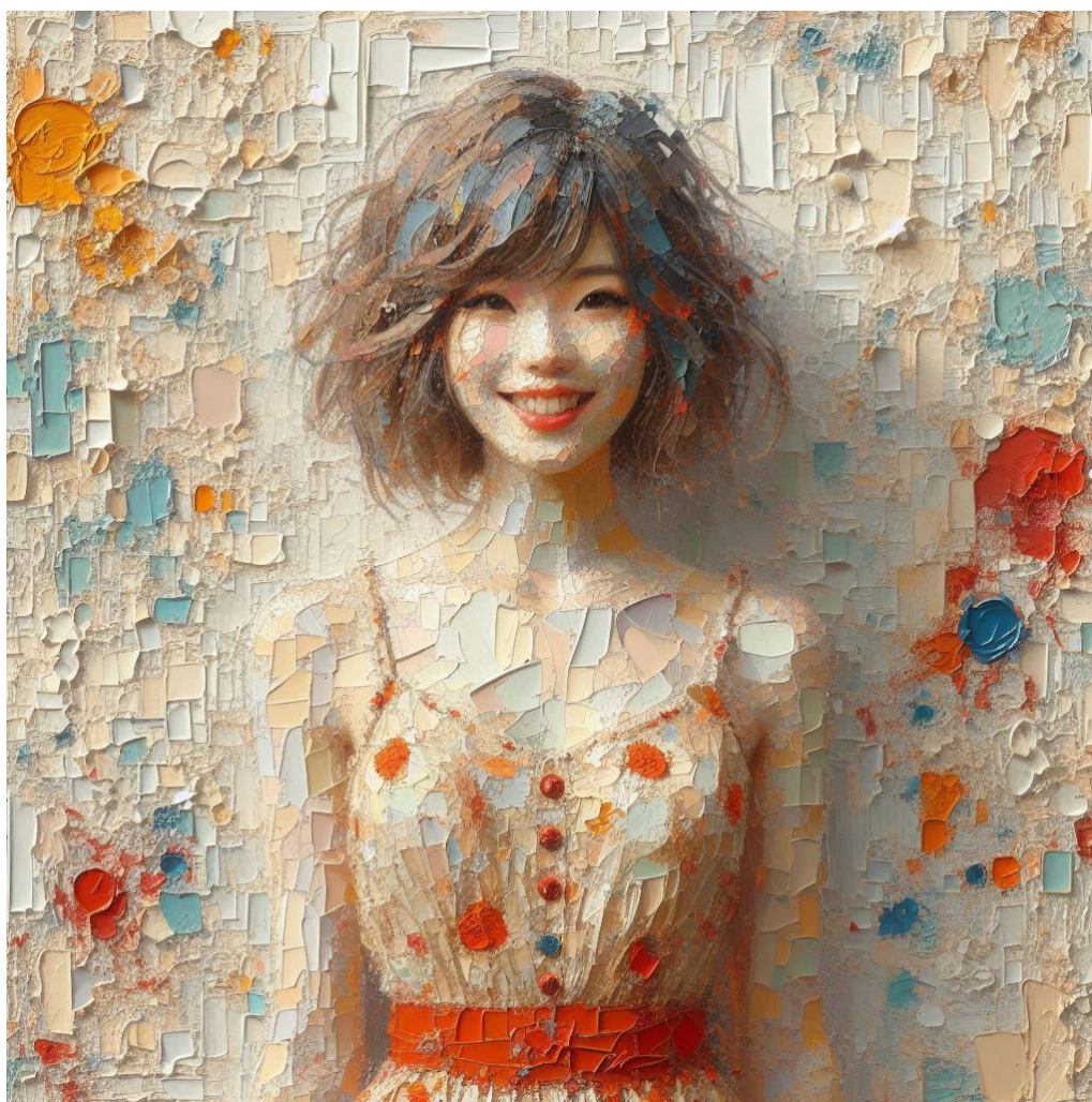
asGgirl1 ( 3 ) .jpg